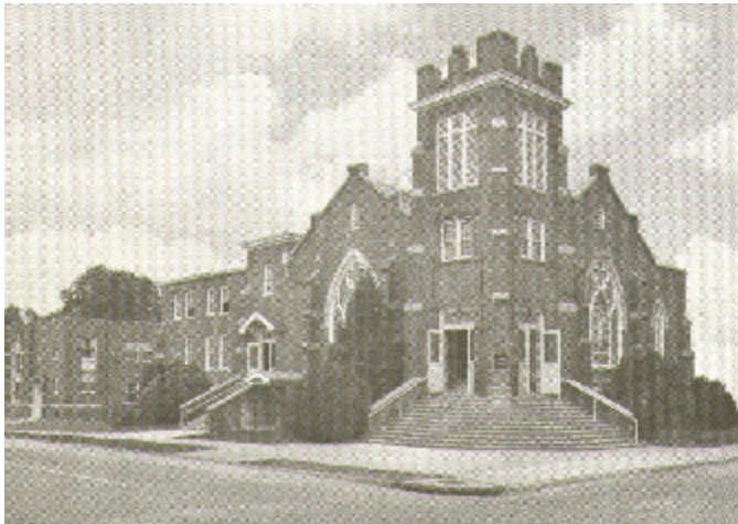
FIRST METHODIST CHURCH